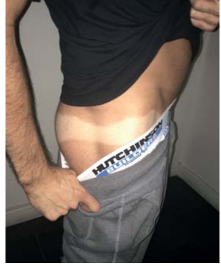
Just a reminder to remove Hutchies' Undies BEFORE getting a fake tan spray.