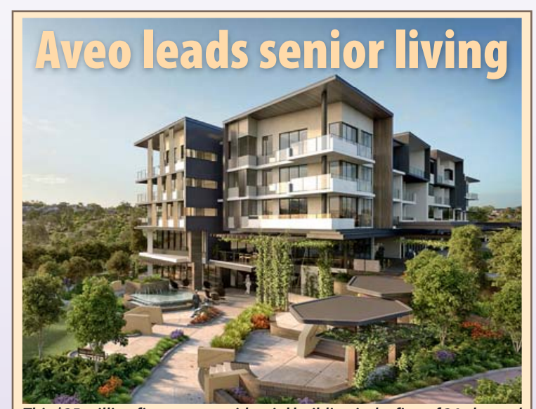
This $25 million five-storey residential building is the first of 24 planned for the new Aveo Springfield Retirement Village.

"Youi's success story shows that the Sunshine Coast offers strong opportunities to establish, grow and operate a global undertaking from our region."