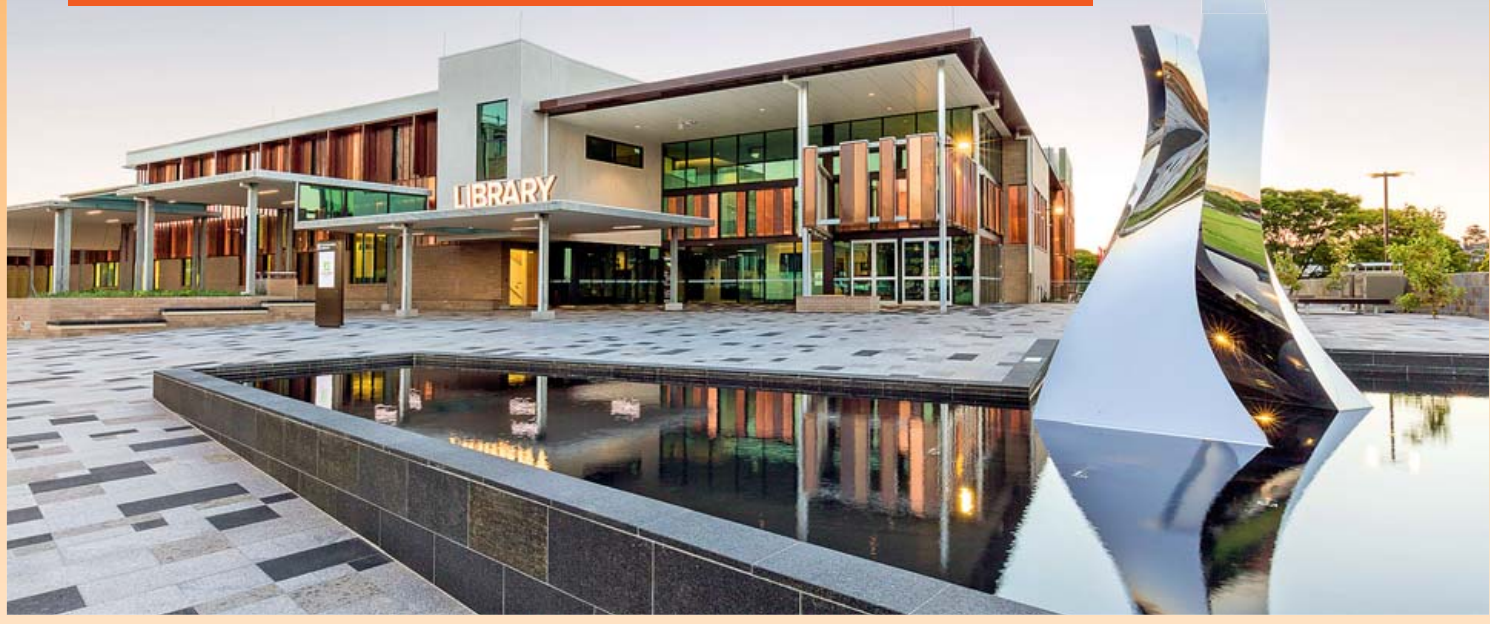
Toowoomba Regional Council Library – Master Builders Project of the Year (Downs and Western).

HUTCHIES' Toowoomba team had 15 entries in the Master Builders (Downs and Western) Awards – producing eight winners including the major award of Project of the Year.