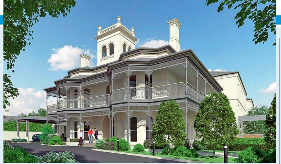
Allity Princeton View Aged Care in Brighton East is currently undergoing extensive refurbishments.