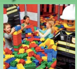
Hutchies is building the southern hemisphere's first Legoland Discovery Centre.

Hutchies previously delivered several projects, including the $3m upgrade, renovation and theming displays at Underwater World Sea Life, on the Sunshine Coast.