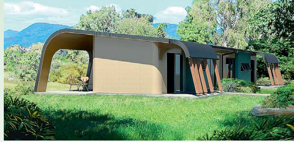
Surrounded by natural bushland, the SAIF project facility will cater for Indigenous clients with brain injury and severe disabilities.

THE Supported Accommodation Innovation Fund (SAIF) project under construction by Hutchies in Cairns, in far north Queensland, will provide supported accommodation for eight clients with severe and profound disabilities.