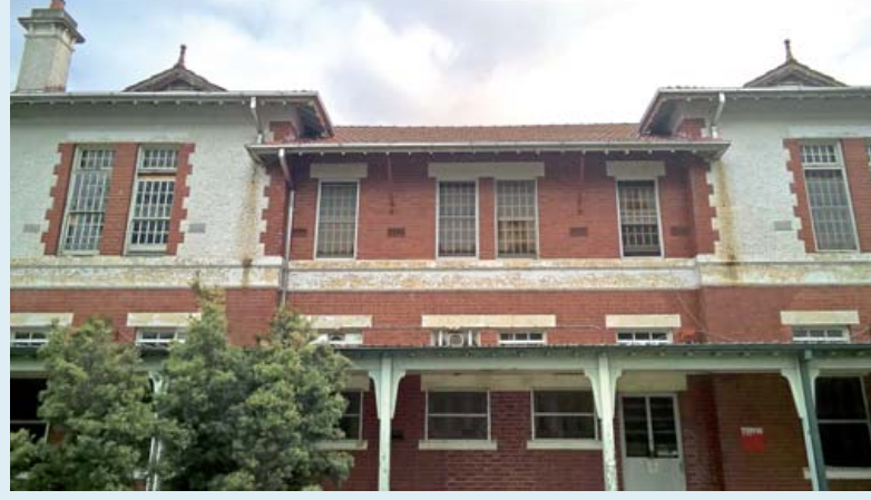
Hutchies is refurbishing two double-storey heritage-listed terraces at La Trobe University.