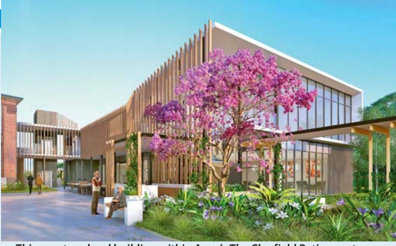
This new two-level building within Aveo's The Clayfield Retirement Village will be for dining and communal use.