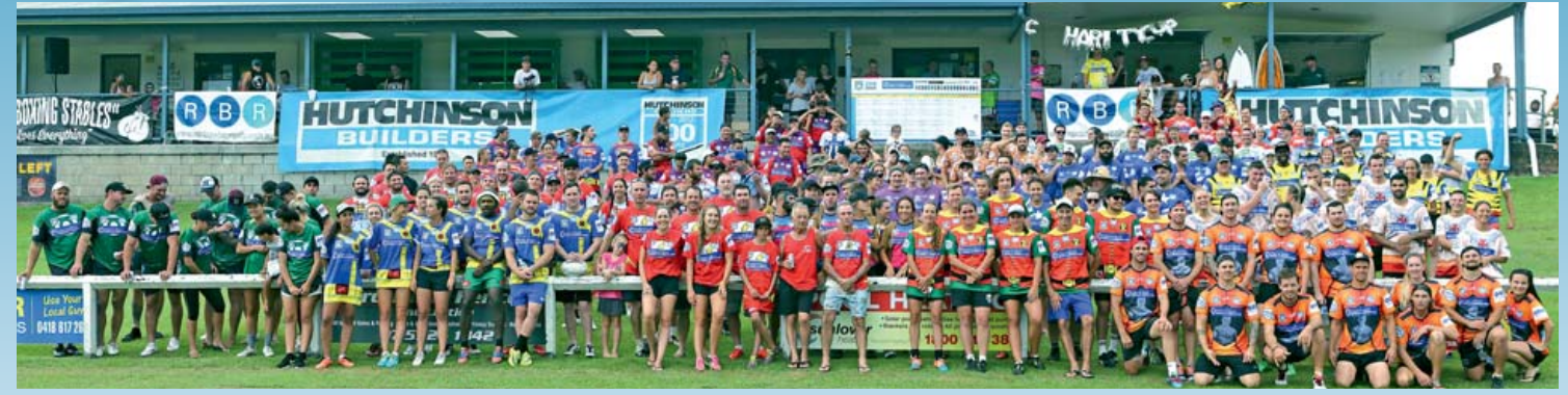
A big community turnout supported the annual Charity Cup at Cabarita Beach.

THE Charity Cup played at Cabarita Beach each year is more than a touch football tournament ... it is a day all about the community, with funds raised to help needy families.