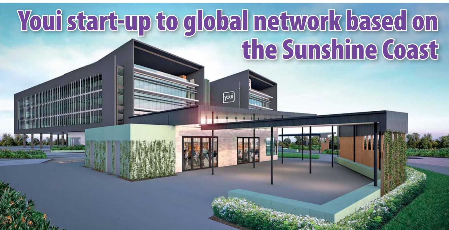
Stage one of insurance group Youi's proposed new global headquarters at Sippy Downs on the Sunshine Coast.

INSURANCE group, Youi, has engaged Hutchies to build the first stage of its new $80 million global headquarters at Sippy Downs on Queensland's Sunshine Coast.