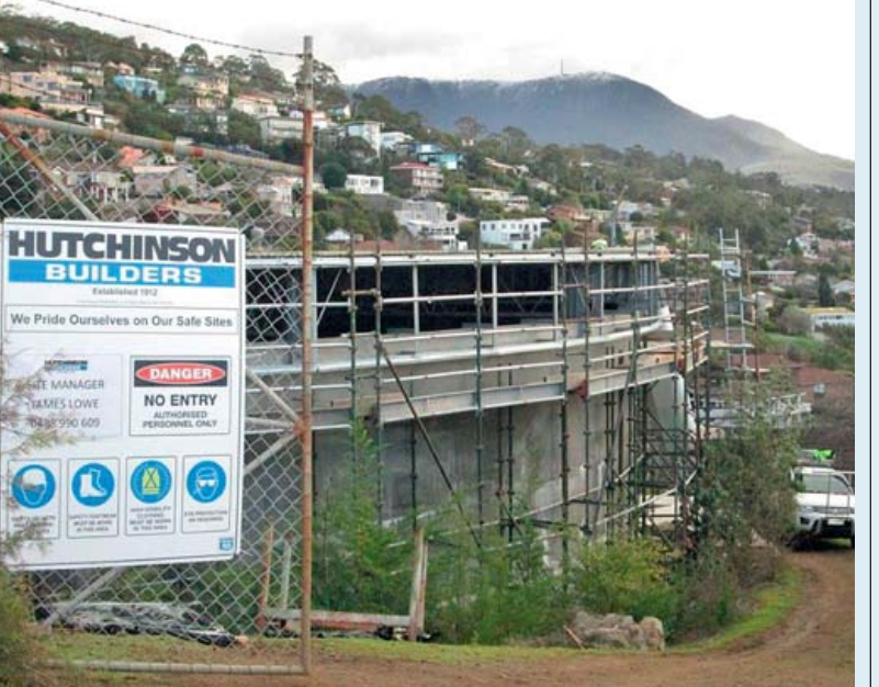
Hutchies is undertaking the complete recladding of this water reservoir in Tasmania.