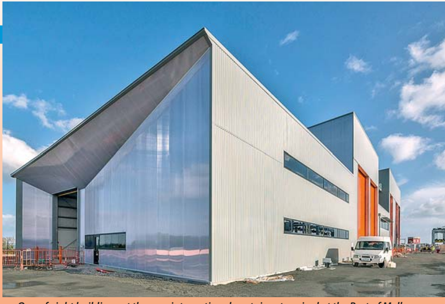
One of eight buildings at the new international container terminal at the Port of Melbourne.

Stage two consisted of the construction of a high-bay terminal workshop as well as an administration building.